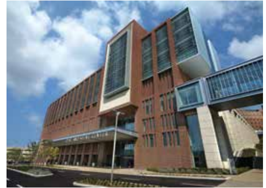
Joint & Spine Center