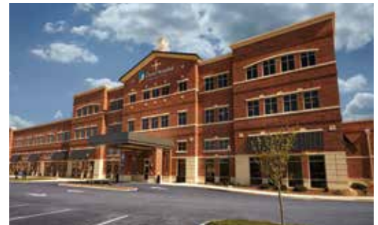
Montgomery Outpatient Center

The Christ Hospital Health Network has a significant presence in the region, including::