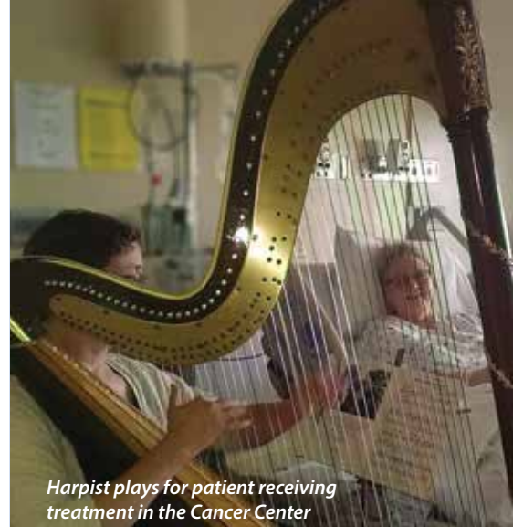
Harpist plays for patient receiving treatment in the Cancer Center