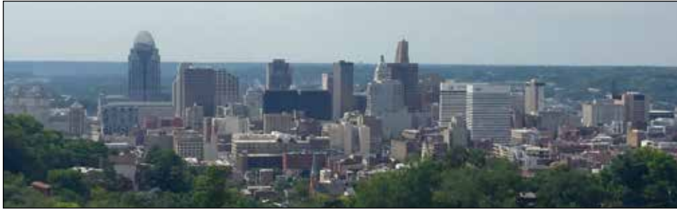
View from The Martha S. and Carl H. Lindner III Rooftop Garden & Skydeck